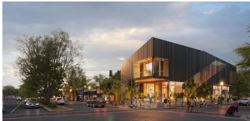
Edes Building and Art Gallery Opening Spring 2024, Downtown Morgan Hill