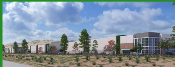
Cochrane Technology Park