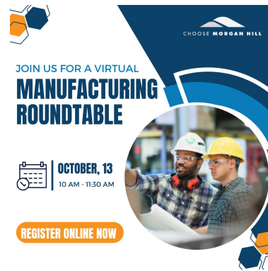
Manufacturing Roundtable and Student Tours