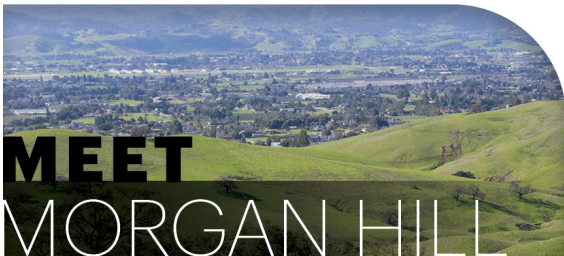
Meet Morgan Hill Silicon Valley Business Journal