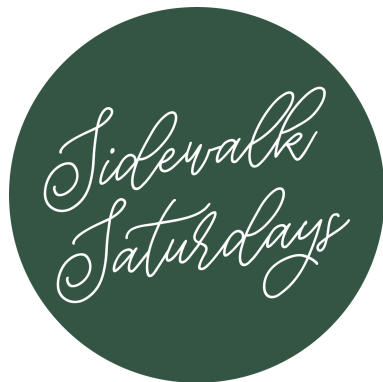
Sidewalk Saturdays Vendor Market